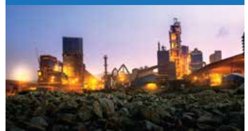
KARNAFULLY GALVANIZING MILLS LTD (BANGLADESH)